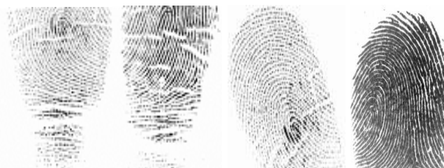
Figure 1: Dataset Images of FVC 2002

For experimentation FVC 2002 fingerprint dataset is used. It consists of latent to rolled fingerprints [4]. These images are of approximate 500 PPI. These images are taken using capacitive and sensor dataset. Some sample images are shown in figure 1.